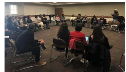
Round-table discussion among attendees at the Conference