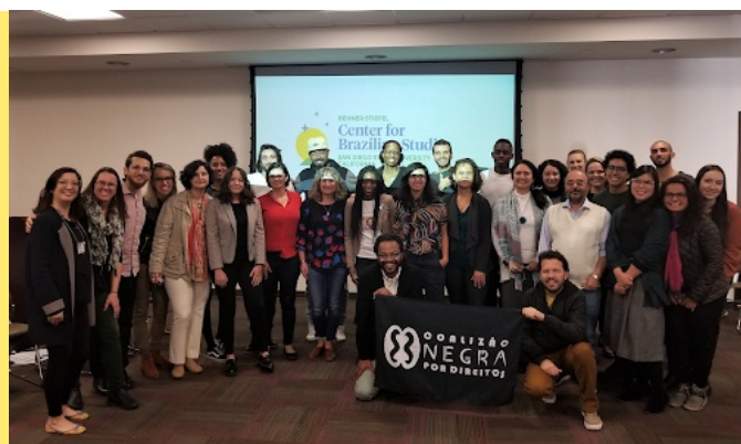
Attendees at the 2020 California Brazilianist Conference