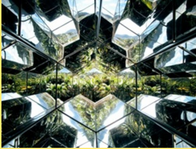
Anais's second-place photo in SDSU's Be International Photo Contest, "Environformation", taken in Brumadinho, MG, Brazil

captura um prisma parecido com um espelho que contém vegetação exuberante cercada por espaços em branco. Anais disse que a foto mostra a transformação pela qual a Terra está passando - e continuará passando - se não cuidarmos do nosso planeta.